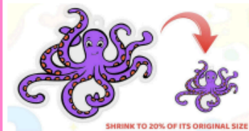
Shrink Dink Keychain