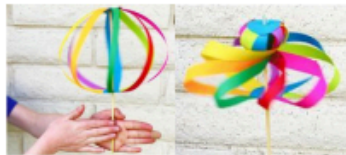
Rainbow Paper Spinner toy